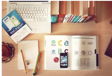
Figure 2: Media.

If you would like to cite a copyright-free image, please proceed as follows: