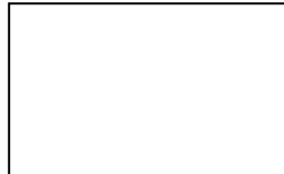
Figure 1: Motivational Interventions.

Self-created images do not need to be cited. If you would nevertheless like to cite them, please proceed as follows: